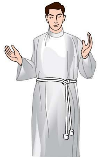
Knot is on left hip