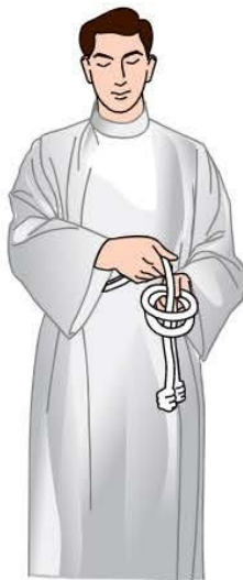
Slip knotted ends through loop (where left hand is making sure that single loop is on top of double cincture.) Feed knotted ends through loop from top to bottom