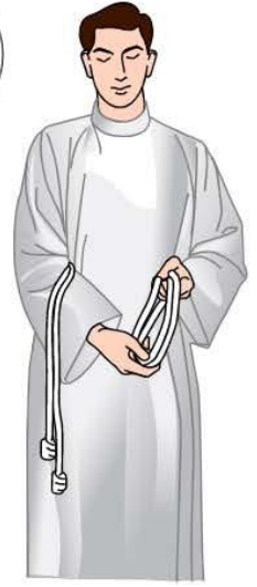
Using right hand, slip loop over left hand, keeping hold of cincture