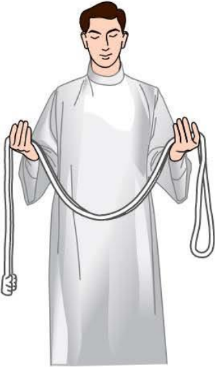
Fold cincture in half