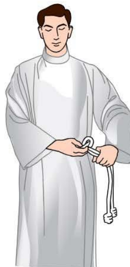
Drop loop and then tighten around waist