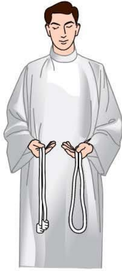
Wrap around waist with knots on your right side