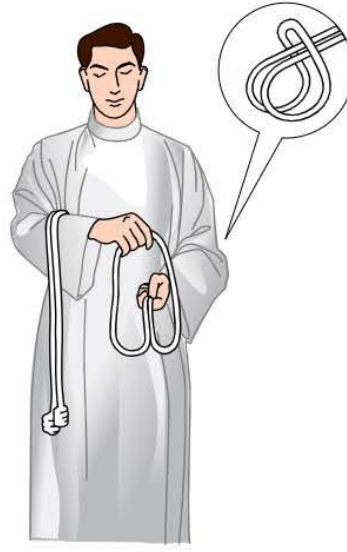
Grab end of loop made by the fold and overlap as shown