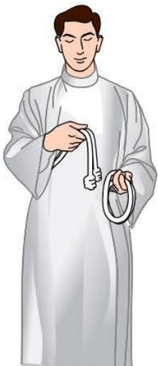
Grab knotted end with your right hand